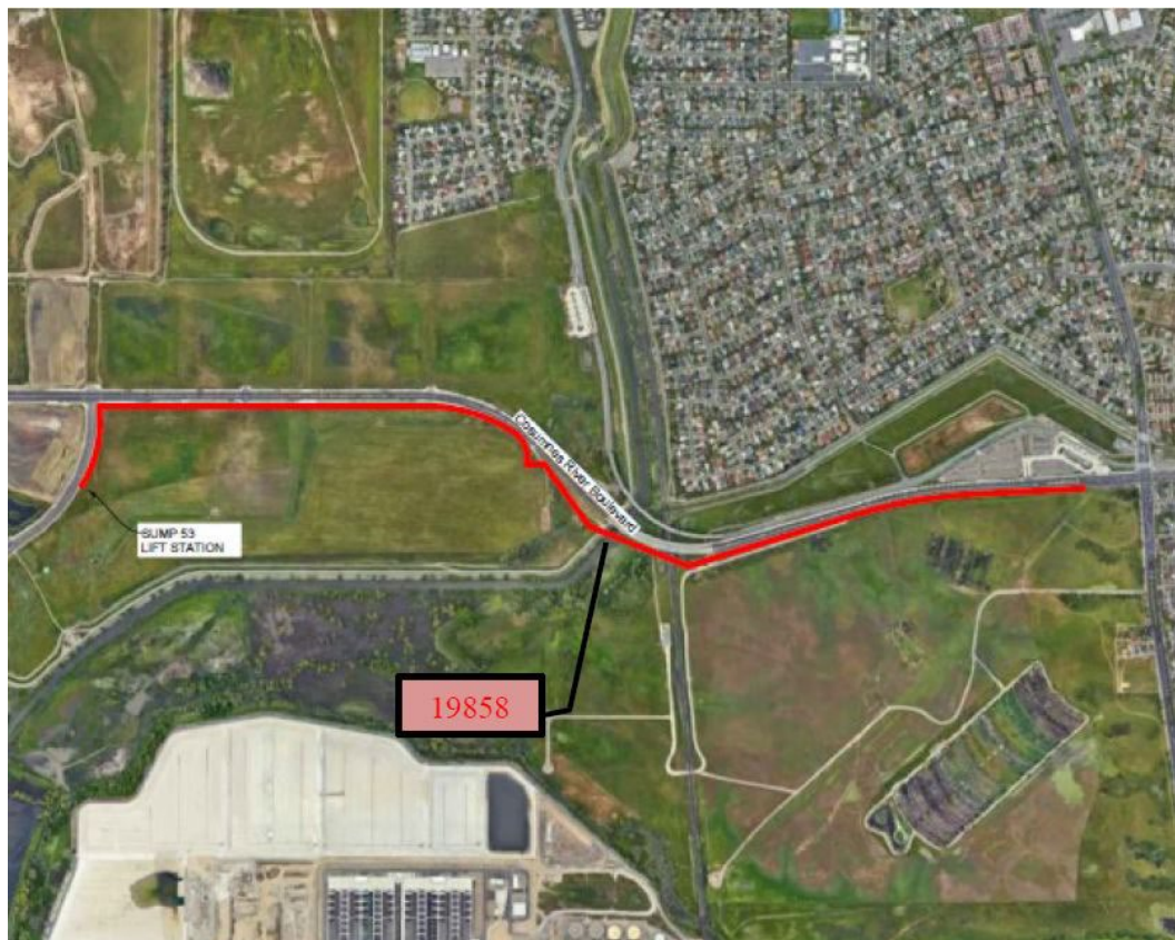
3) Approximate project footprint map